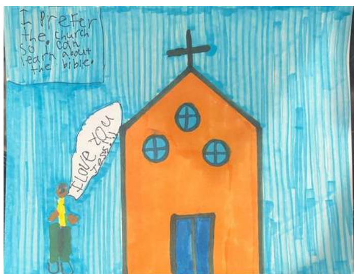
BY ETHAN CHACKO