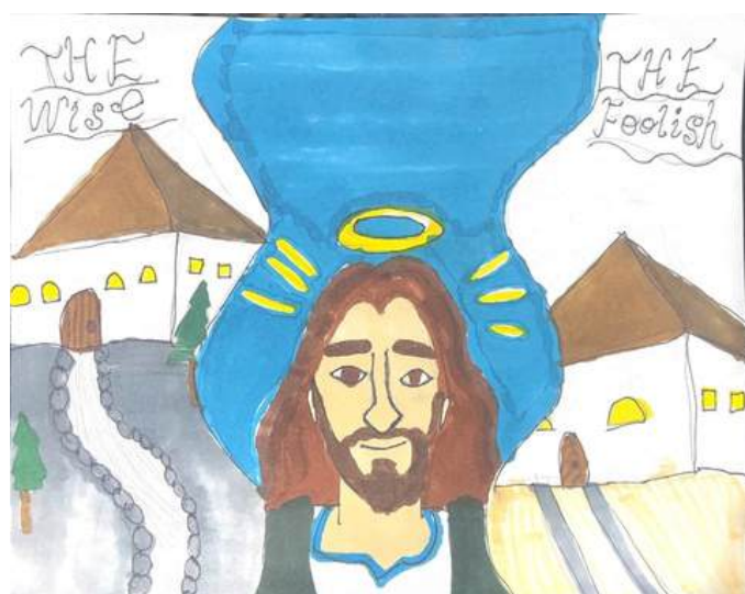
BY EIJAH CHACKO