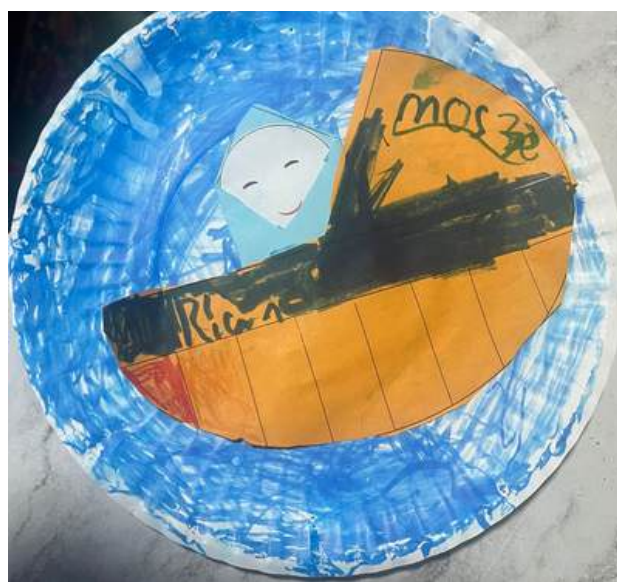
BY RIAN VARGHESE